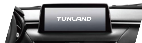
10.25-inch levitation intelligence center control screen