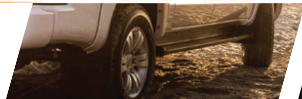
18-inch large size aluminum alloy wheel hub