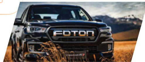
Front Crash Warning, Bosch 9.3 ESP