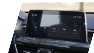
10.25-inch Levitation Intelligence Centre Control Screen