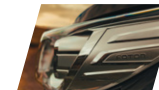
Large Fog Lamps with 3-way LED Daylight Running Lights