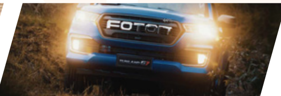
Large fog lamps and three-way LED Daytime Driving Lights