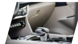
Max Horsepower: 163 Max Torque: 390N·m